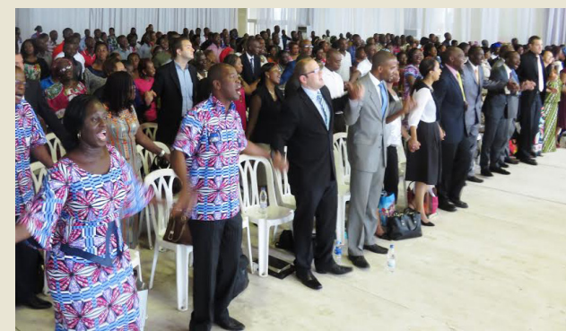
THE GLORIOUS FIRST AFRICAN MISSIONS CONFERENCE IN ABIDJAN, IVORY COAST!